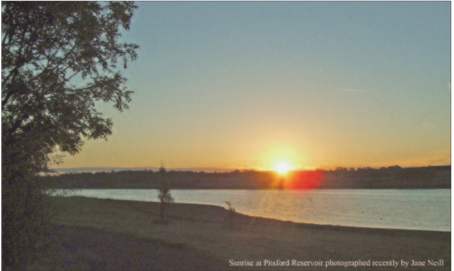
Sunrise at Pitsford Reservoir

Pitsford Reservoir was opened in 1956 by the Queen Mother. Prior to that date, a number of villages in the area did not have a mains water supply. Celebrating the 50th anniversary of the opening, on the 23rd October 2006 were 56 children and their teachers from Wilsbarton Church of England Primary School who were given a tour of the reservoir. Wilsbarton was one of the villages who did not have a mains water supply prior to 1956. Today the reservoir supplies 45 million litres of water every day to homes in the area.