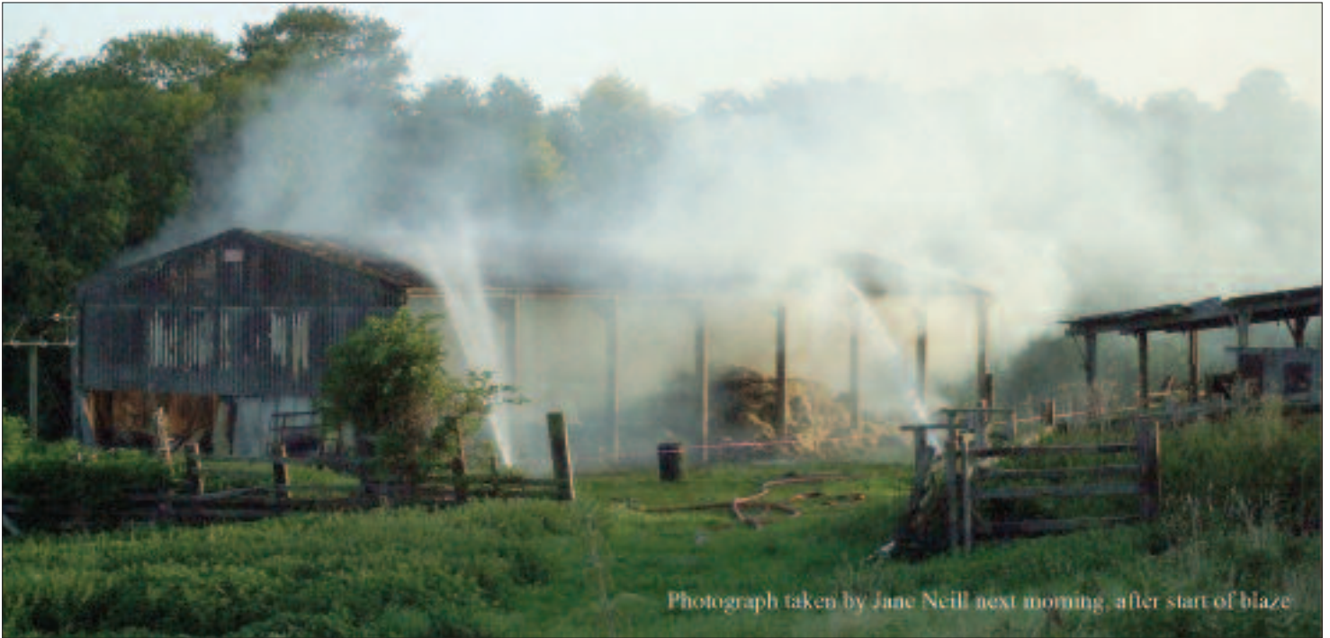
next morning, after start of blaze

The day before most schools re-opened after the summer holidays, a large barn near the bottom of Froghall was set on fire. The smell of burning hay was noticeable for about an hour in many parts of the village before police vehicles with loud-hailers were touring the village instructing residents to go into their houses and shut all doors and windows and not to remain outdoors.